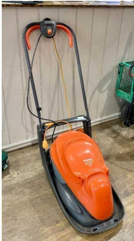
Knife / Blade Sharpening Service

If you are in the process of having a spring clean and realising you just have too much 'stuff' and you think the Library of Things might benefit from it, then do email hello@shareandrepair.org.uk with details of the itmes